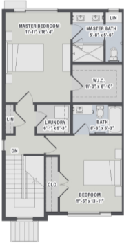
BUILDING 1 (UNIT Em) LV3