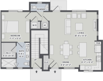
BUILDING 1 (UNIT A1/A2) LV1