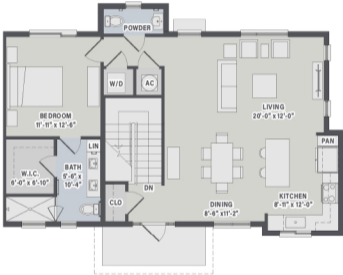
BUILDING 1 (UNIT A1/A2) LV1